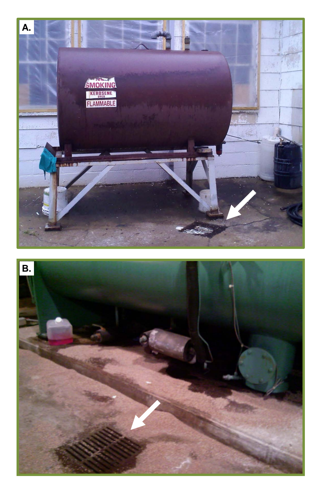
Figure 2. Outdoor (A) and indoor (B) oil storage tanks located near drains. The locations would obviously (rather than "reasonably") be expected to direct spills to surface waters in harmful quantities.