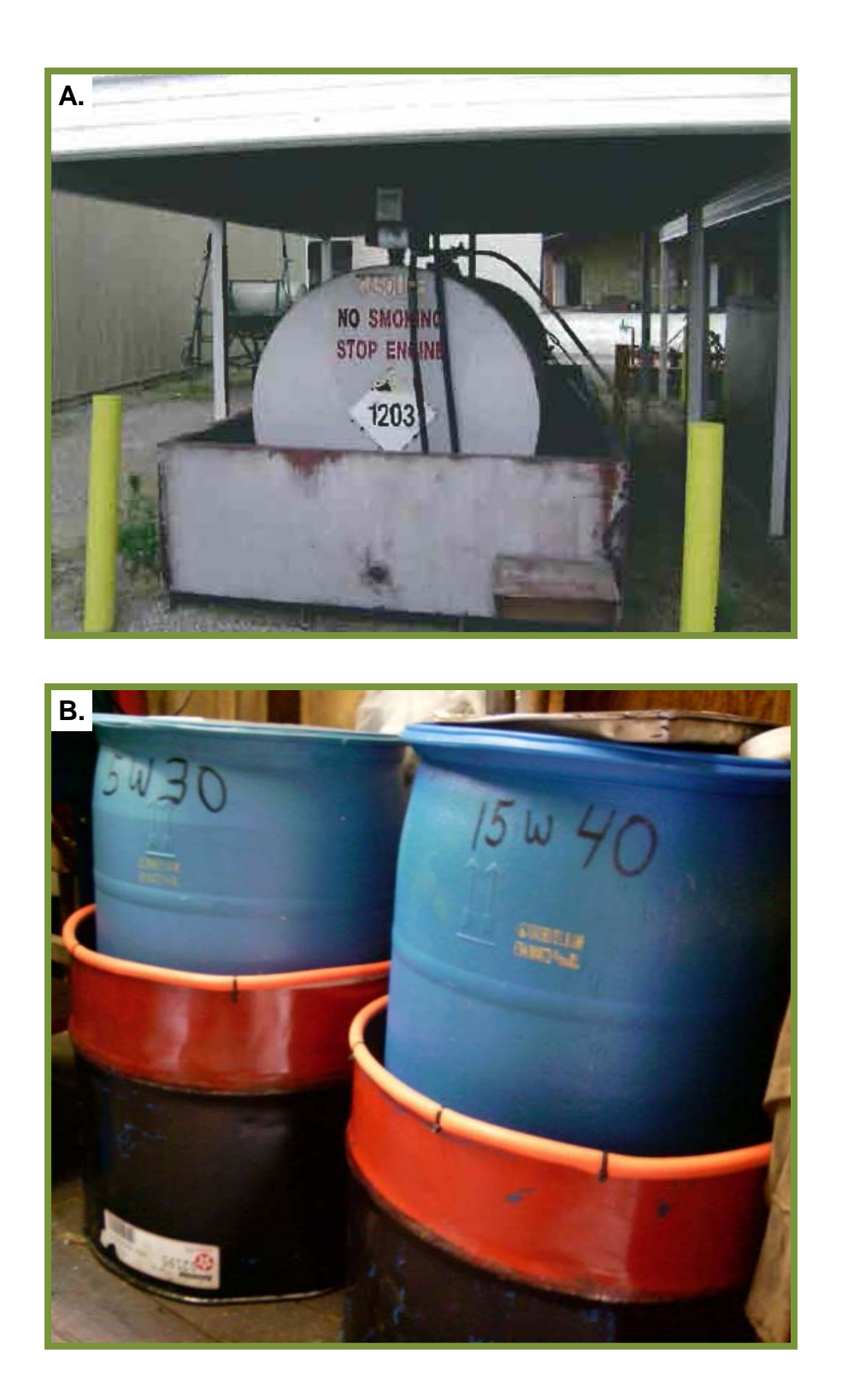
Figure 4. Examples of an outdoor (A) and indoor (B) oil storage tanks with oil spill secondary containment structures.