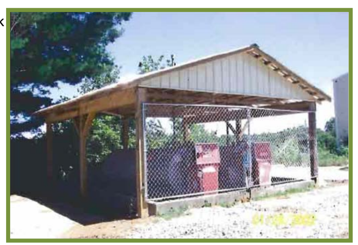
Figure 6. Gas and diesel tanks (1,000 gallons) with a roofed concrete secondary containment.

Where practical, place a roof over the tank and secondary containment so that rainfall does not accumulate within the structure ( Figure 6 ). Although a roof will represent an expense and something else to maintain on your farm, it will eliminate the hassle of managing accumulated water that could otherwise corrode the tank and tank supports. If your secondary containment is equipped with a drain, the