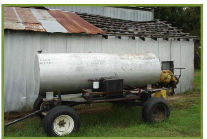
Figure 5. An on-farm diesel fuel nurse tank.

Farm nurse tanks ( Figure 5 ) do not require dedicated secondary containment but must be positioned to prevent a discharge (e.g., away from ditches).